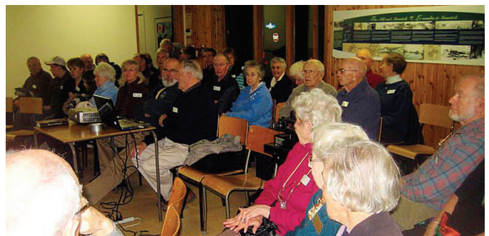
The meeting was held in the Carriage Shed at the Mill in Manotick.