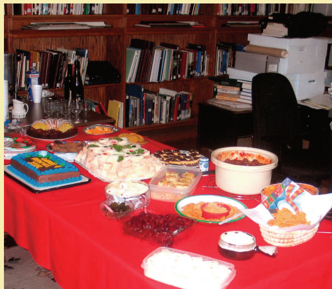
Can we cook or can we cook?

This year the Pot Luck will be held at Knox Presbyterian Church in Manotick instead of the Anglican Church in North Gower due to an expected large attendance.