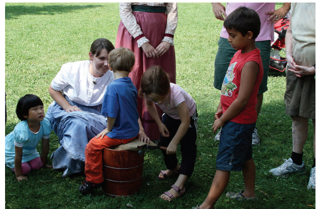
Making ice-cream at the Dickinson House in 2009.

In regard to next year, program planning for the 2011 season is well underway. Work with the City of Ottawa on a 2011 Licence of Occupation (LOO) is progressing. The RTHS is pursuing a joint LOO with Watson's Mill in which costs such as grass cutting would be shared.