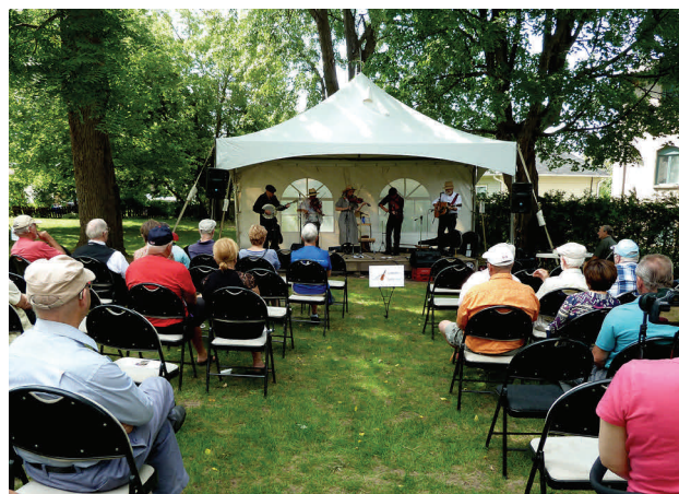
The Country Fair at the Dickinson House was very well attended and was enjoyed by all. In particular the three bands that played were much appreciated.

Any member of the Society who has an interest in this project is invited to join us for this meeting to contribute ideas and names of those to be interviewed. The committee would appreciate any help you can give us.