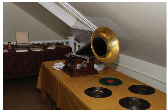
The gramophone exhibit was another popular display at the Dickinson House this past summer.

Part of the display in regard to the "Local Heroes of the Great War, 1914-1918", which was prepared for Remembrance Day.