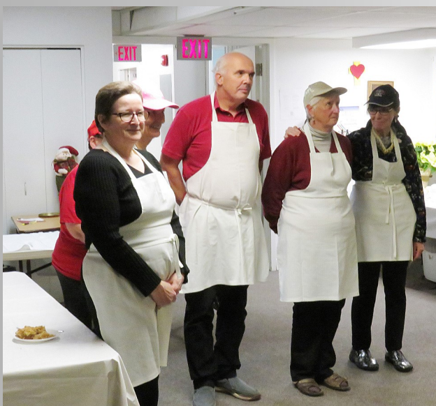
The ladies and a gentleman of the Eastern Star prepared and served the meal.