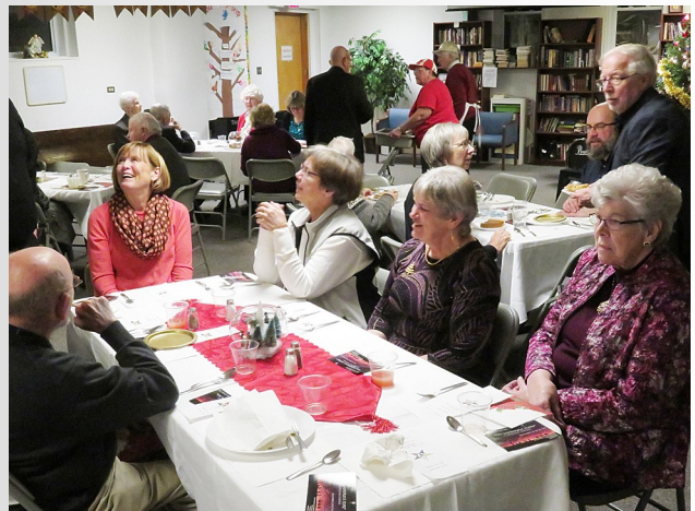
The party was festive and enjoyed by all. It is always a venue for renewing friendships and catching up on our friends' lives.