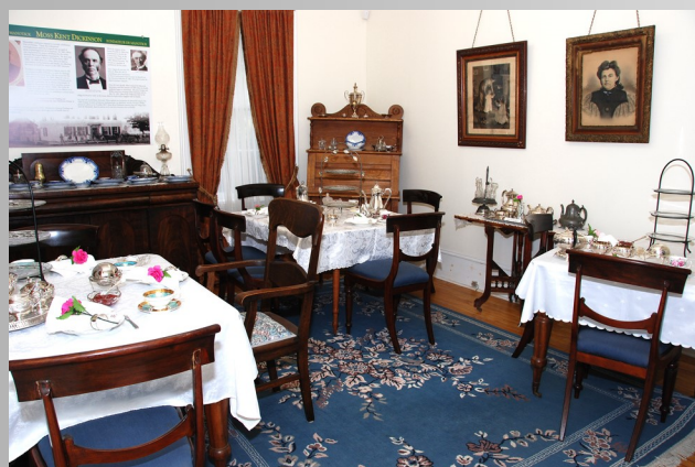
The dining room at Dickinson House set up for the Silver Tea. On the right, one of the beautiful tea services used in the event

Due to the major storm of the night before and the resulting power outage, the tea had to be cancelled. Many of our planned guests were able to switch their tickets to our upcoming Women's Day Tea scheduled for November 3, but for those who couldn't, we held a mini Silver Tea in the dining room on September 29. Our guests were very appreciative and a lovely time was had by all.