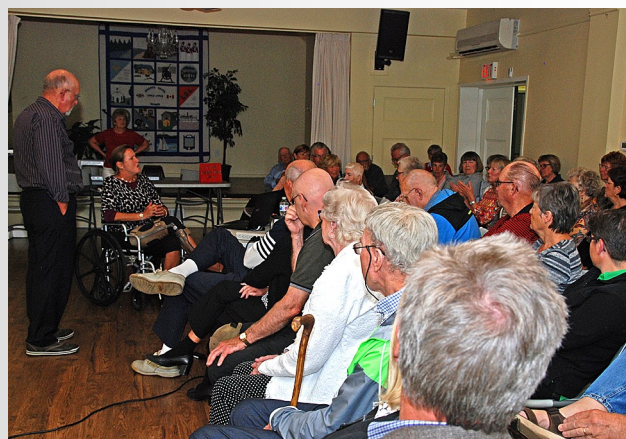
The September meeting was well attended (60) as the speaker is from the area. Thanks to the programme committee for thinking of that.

She discovered that she didn't need horses to have an identity.