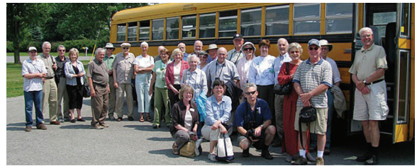
The group at North Gower