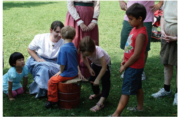
At least you get to sit and hold down the ice cream maker after your turn on the crank.

Finally, the proof of the pudding is in the eating. After all that work, boy does the ice cream taste good.