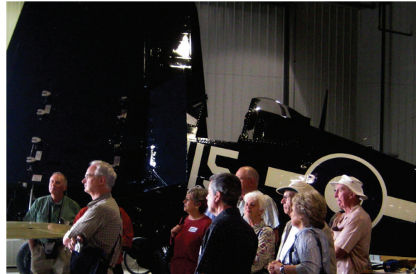
RTHS members listen intently in front of a WW II Corsair.