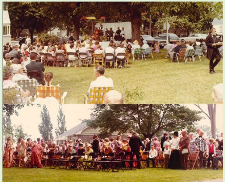
Great turnout for the all-churches service