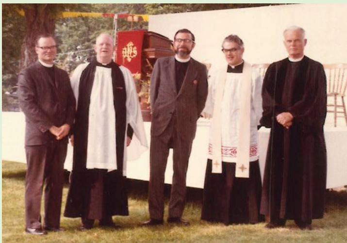
Clergy for the all-churches service at the United Church grounds

One of a number of event schedules produced for the celebrations.