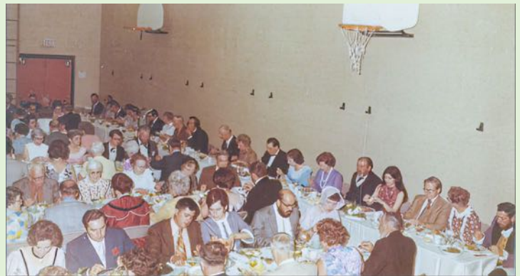
Anniversary banquet in the Public School