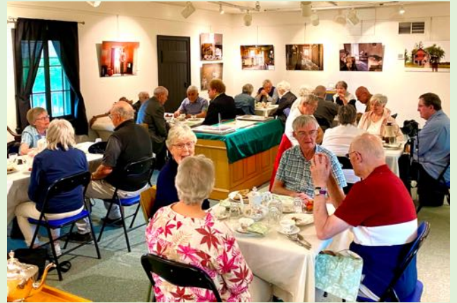
Tea & Treats are Served

Our tour group was then treated to tea and a dessert of fresh fruit, scones and cookies – a very nice finishing touch to our Heritage House tour.