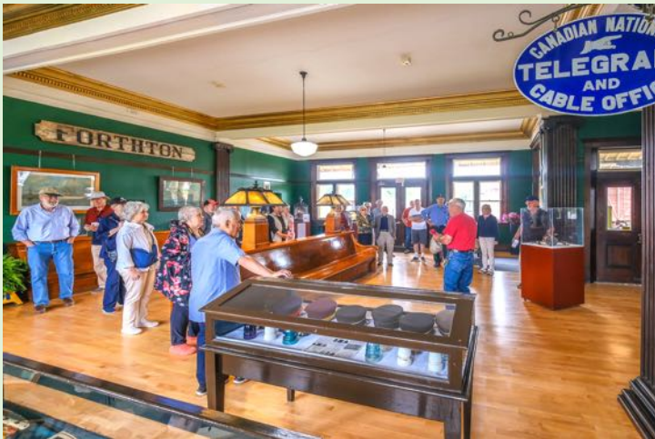
Refurbished Station Interior

We broke for lunch at the "The Lockmaster's Taphouse" restaurant on Beckwith Street. This provided a time for the group to have some good food, socialize, and discuss the day's events so far.