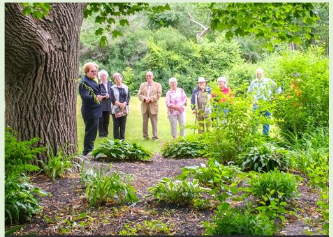
Exploring the Grounds

Our day ended with a short guided tour of the Old Slys Lock with highlights of the geography, local flora and fauna.