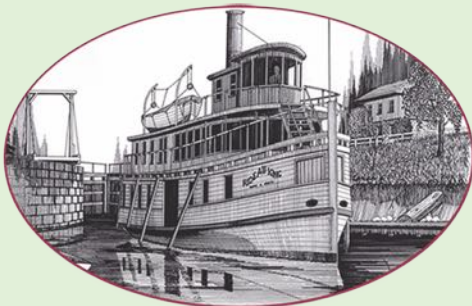
Rideau King - 1920, by Jack Cook