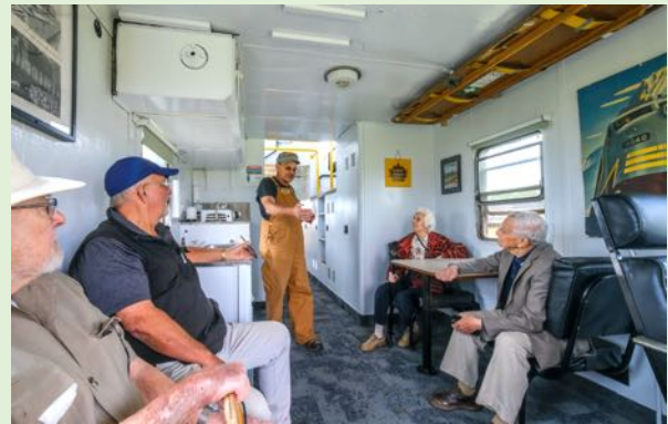
Riding the Caboose

The museum has a number of rolling stock including a passenger car, a dining car, a sleeper car for railway workers, even cars suited out to provide dental services to remote locations and, of course, a caboose. The group was treated to a caboose ride on a short track and offered a walk through the various other cars.