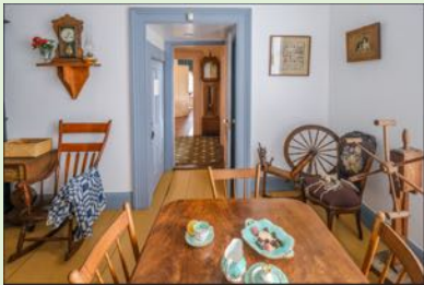
Staff Dining and Hallway to Main Living Area

The rooms were wonderfully set out with a number of heritage pieces of furniture, mirrors, drapes and dishware that dated back again to the mid 19th century. Items of particular note were: in the hallway, the brass works for the Tall Case of a Grandfather Clock which were brought from Scotland in 1850; in the hallway and study, the oil lamps were suspended from the ceiling with a pulley systems to allow for changing the lighting conditions and filling the lamps; in the library/study, the antique telephone switchboard which was used by telephone operators to connect calls; in the parlour, a boudoir-sized Grand Piano with rosewood veneer and octagonal tapered legs which had been brought from England and was made around 1855 by Broadwood and Sons in London, England.