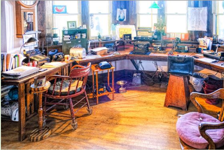
Stationmaster and Telegraph Office

We finished our visit to the railway museum with a guided tour of the station including the operator's bay which was the nerve centre of communication for the station. The telegraph operator had many tasks from receiving and shipping express orders to selling tickets and giving orders to train crews and sending/receiving telegrams. The station and operator's bay area was a particularly fascinating part of the tour with so much to see and take in.