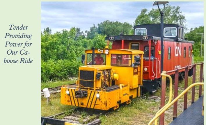
Tender Providing Power for Our Ca- boose Ride