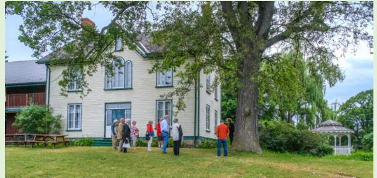
Rear Facade of Heritage House (identical to front)

The heritage house has two distinct unique features: one is described as a mirror image facade with the front and back side of the house identical in structure; the second is the house boasts the only two-story privy remaining in Eastern Ontario. The house was acquired by the Town of Smiths Falls in 1977 and was restored and opened to the public in 1981.